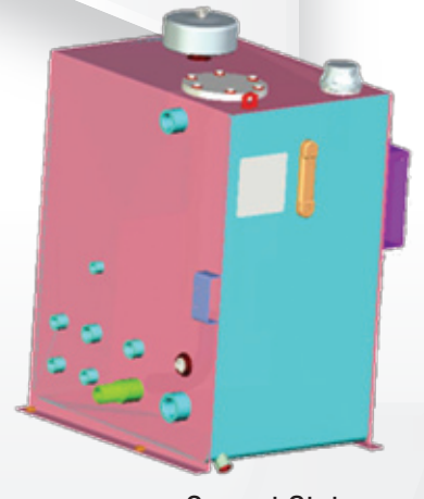
Current State 40 Gallon Hydraulic Tank

To provide a cost reduced common hydraulic tank for the JLG Series 800A and 800S Series boom lifts.